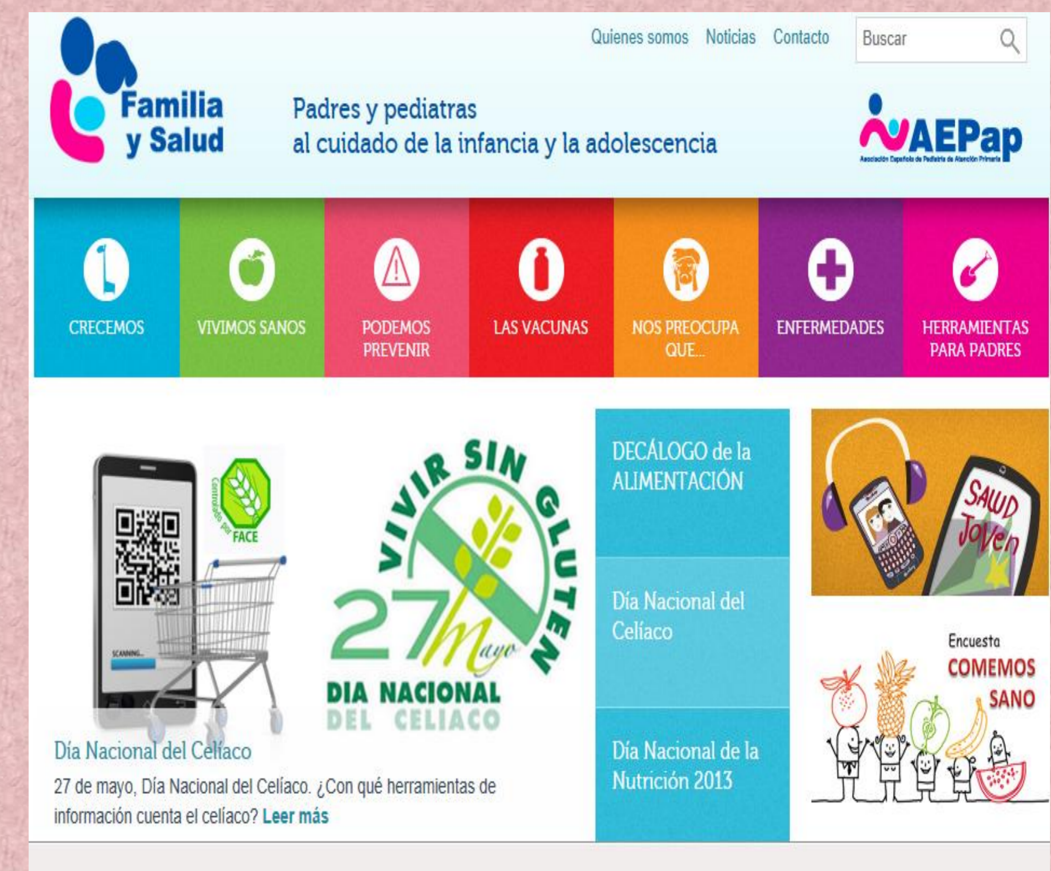
Table 1. Contents of the website Familia y Salud www.familiaysalud.es

The summary of views is described in the Graphic 1.